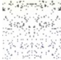
Image map in black and white quadrille squares of the first grid portion of the same text only with the Ben Asher editing removing two waw's (see attached materials). In it we can plainly make out a large beast devouring a human head.- mapped by author.

traditional text, when you try this with the ben Asher-based texts. Two missing waw's are what produce the image from the first grid (of the same three above) from the ben Asher-type version of the Torah, illustrated here;